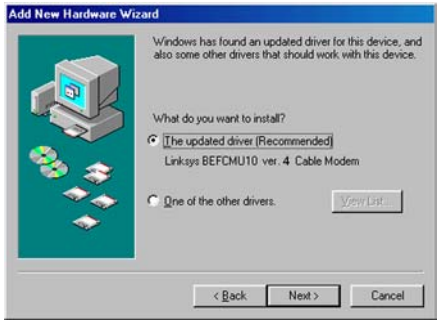
Figure 7-4: Select Updated Driver

Congratulations! The installation of the Cable Modem is complete.