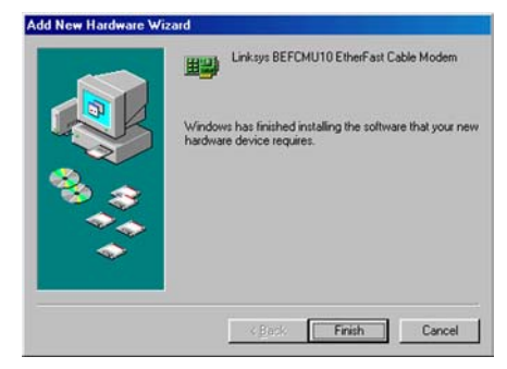
Figure 7-6: Driver Installation Complete