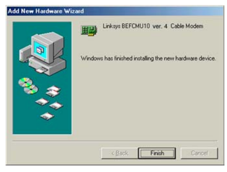
Figure 6-2: Driver Installation Complete