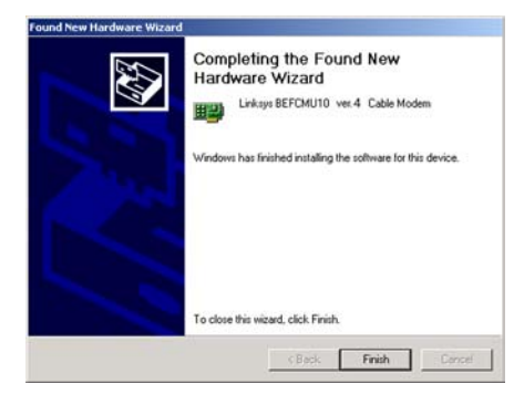
Figure 5-5: Driver Installation Complete