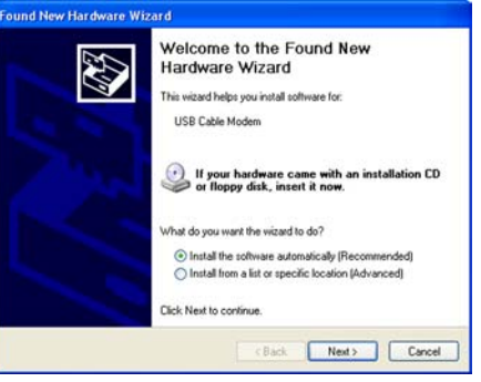
Figure 4-1: Welcome

Congratulations! The installation of the Cable Modem is complete.