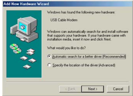
Figure 6-1: Add New Hardware Wizard

Congratulations! The installation of the Cable Modem is complete.