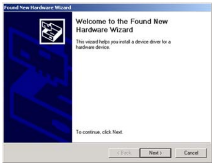
Figure 5-1: Welcome