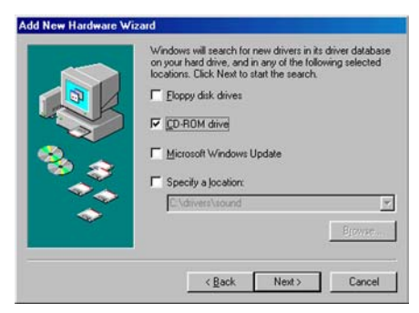
Figure 7-3: Select CD-ROM Drive