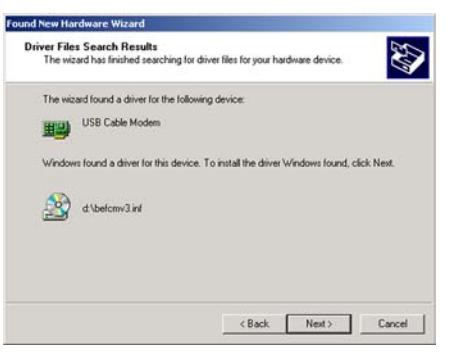
Figure 5-4: Driver Files Search Results

Congratulations! The installation of the Cable Modem is complete.