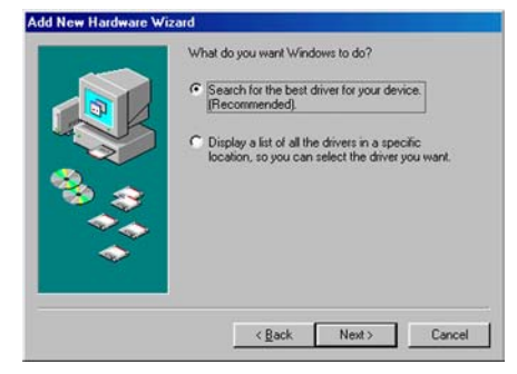
Figure 7-2: Search for Driver