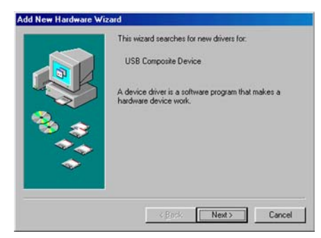
Figure 7-1: Add New Hardware Wizard