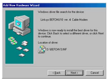
Figure 7-5: Location of Driver