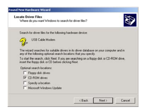
Figure 5-3: Locate Driver Files